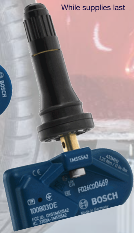
Snap-in Rubber Valve — Black QF0471