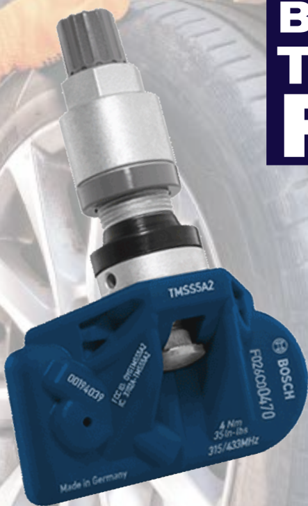
Clamp-in Metal Valve — Silver QF0470